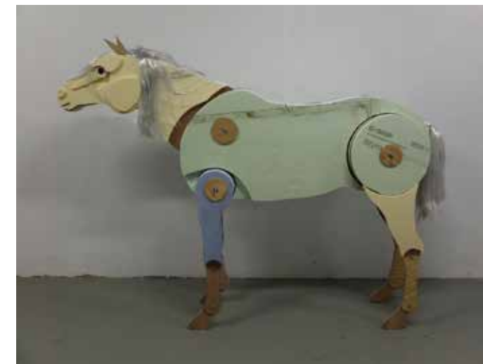
A horse, a horse! (Shakespeare, The Tragedy of Richard III )

Quartair takes as its starting point the famous centuries old bronze horses on the Basilica San Marco in Venice. This work of exceptional craftsmanship is a landmark in the history of art but also tells a story about changing powers. Looted from Constantinople during the first crusades, stolen by Napoleon, then returned to Venice under the command of the Emperor of Austria. Now the original horses remain inside because of on-going damage caused by air pollution.